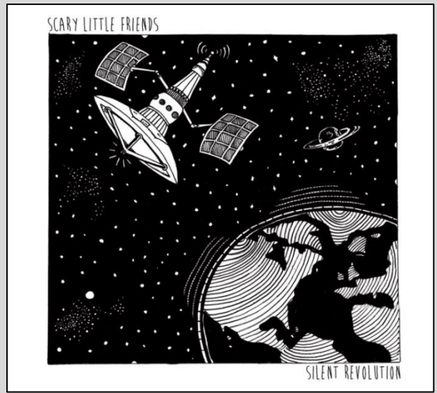
Silent Revolution EP